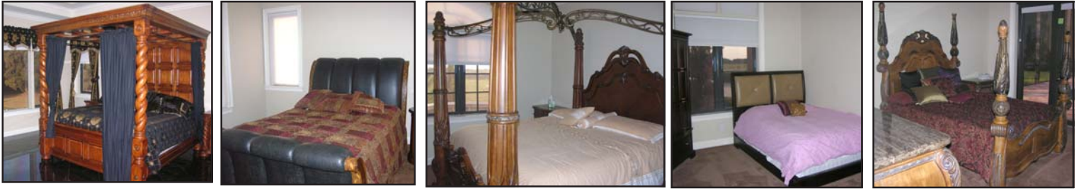
5 spacious bedrooms