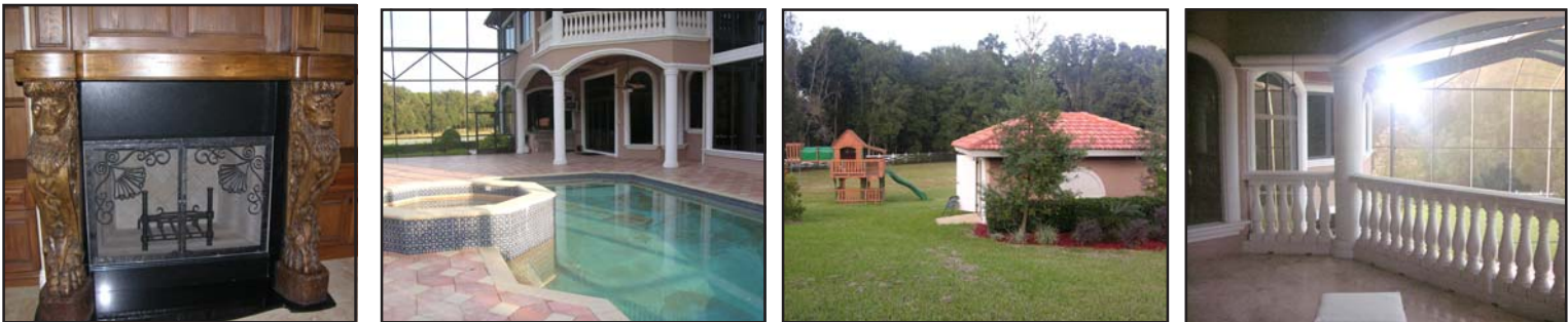
7,560 SF under roof, including 3-car garage

© 2009 Coldwell Real Estate Corporation. Coldwell Banker Commercial® is a registered trademark licensed to Coldwell Banker Real Estate Corporation. An Equal Opportunity Company. Each Office is Independently Owned And Operated.