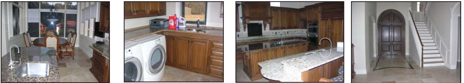
7 bathrooms, spacious laundry room, hand carved fireplace, beautiful foyer area, game room, great room, bar and kitchen