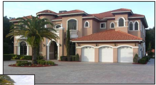
3 Car Garage